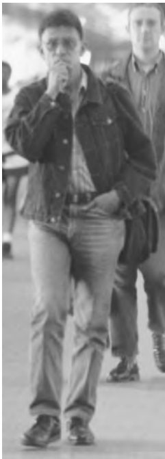
Figure 1.4 A reflective moment

and suppress emotional responses in order to reflect upon them (Figure 1.4). While this capacity can be useful at times, it comes at the price of detaching us from sensate experiences.