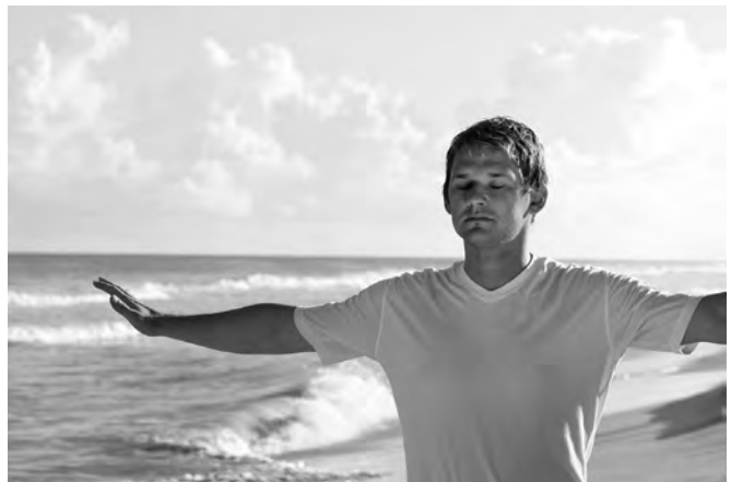
Figure 1.1 Each person has a preferred way of listening to messages coming from body-mind experiences.

In an ideal massage practice, all of your massage clients would be totally receptive and responsive to your work. They would be able to completely relax under your care