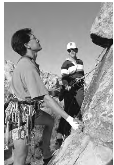
Figure 1.5 Making decisions about the best course of action

Recognizing the positive and negative impacts of the body-mind connection, as well as our ability to function at times as if the body and mind are disconnected, is important for self-development. It also helps us as massage therapists to understand and work more effectively with body-mind dynamics that