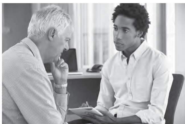
Figure 1.6 Health-care providers acknowledge the complex connections between the body and mind in an integrative medical approach.

During the late 1970s and early 1980s, neuroscientist Candace Pert and colleagues at the National Institute of Mental Health (NIMH) discovered opiate receptor sites